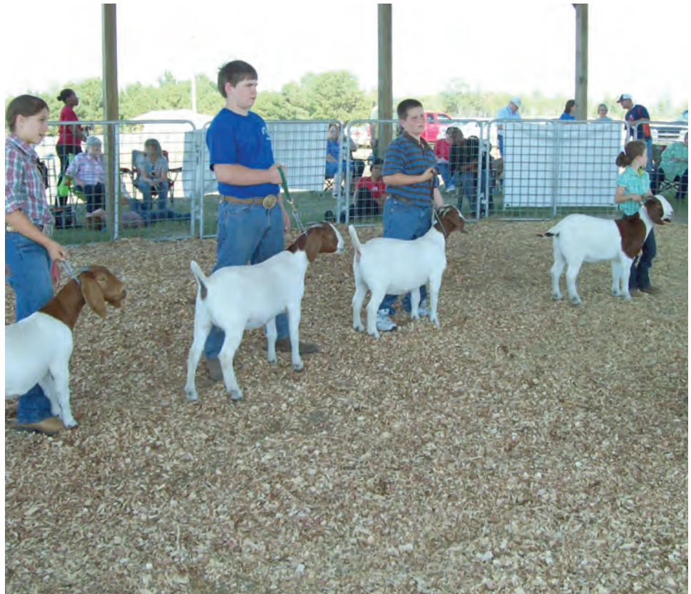
Figure 2. Desired goat posture at the show ring.

Goats selected for shows should be trained for at least two months. Walk and train your goat every day with a leading chain for about 15 to 20 minutes. After each walking and training, reward the goat with some feed. You can mimic the situation of an actual show while walking and training your goat by changing positions, stopping frequently between walks, and adjusting the goat's posture with all legs straight and in parallel position to each other (back legs, front legs, and the back leg and front leg on the same side), straight back, and head in a raised position as shown in Figure 2. During the training, do not harass your goats, but love and care for them so that you can gain trust. Well-trained goat will follow your lead in the actual show, and help you win the competition. Also, make sure to groom your goats before starting each training session so that they get used to the procedures, and will not give you a hard time when you try to do it before the actual show.