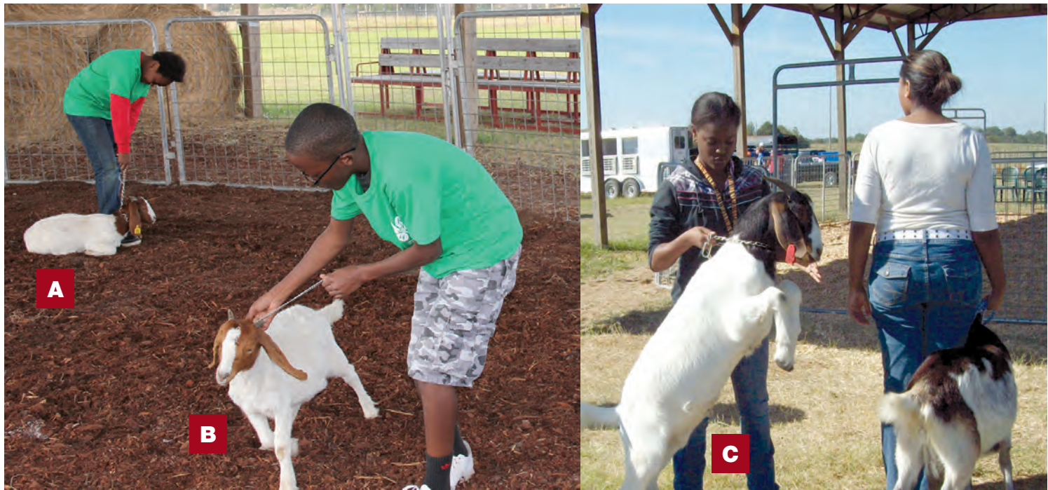
Figure 3. A goat lying down (A), trying to escape (B), and trying to jump (C) at an actual show ring.

Untrained goats will not follow the showing person as desired; instead, they may resist to go to the show ring, become reluctant to walk, try to escape and run away, jump, sit down rather than standing, bend on their knees, and so many other complications, which will lower your score (Figure 3).